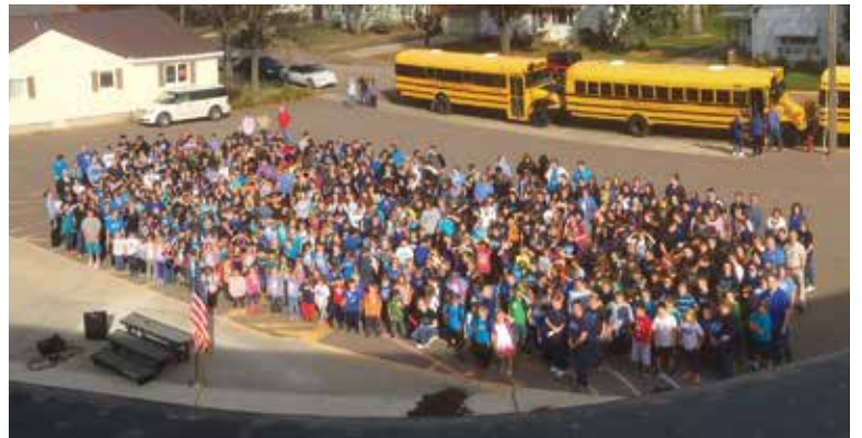
"All School" photo taken at Groundbreaking Ceremony