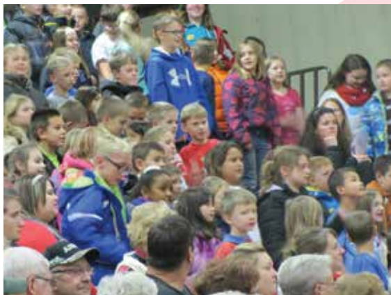
Elementary students sing "When the Saints Go Marching In" at the Veteran's Day program.