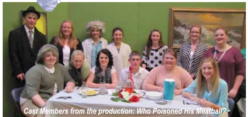
Cast Members from the production: Who Poisoned His Meatball?