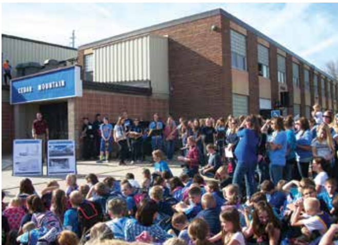
Students, staff and community members gather for groundbreaking ceremony.