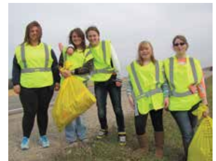
NHS members picked up area road ditches in October as part of their community service.