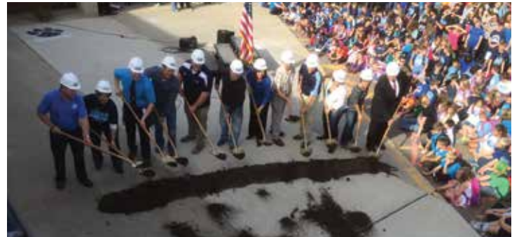
Administration and school board members.

The public is reminded that during games, diagonal parking in front of the school is allowed and encouraged. There are 2 handicapped parking spots in the gravel parking lot next to the district office. We want to keep vehicles out of the area during school dismissal, but after route buses leave, parking is allowed in front of the building.